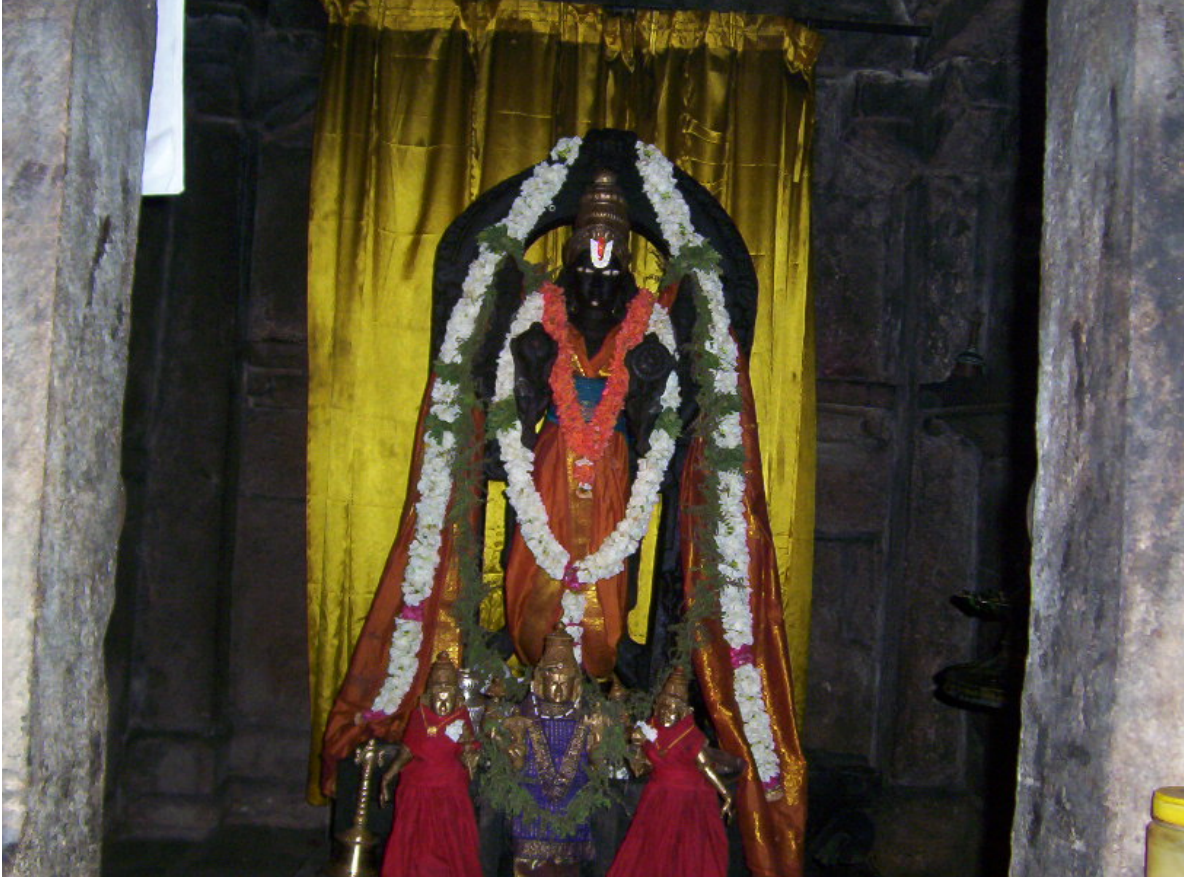
Srikantha perumal of hedathale