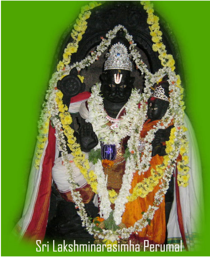
Sri Lakshminarasimha Perumal