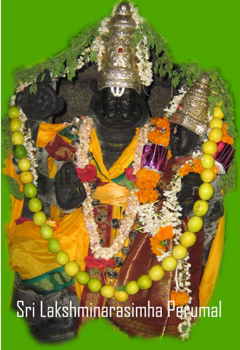
Sri Lakshminarasimha Perumal