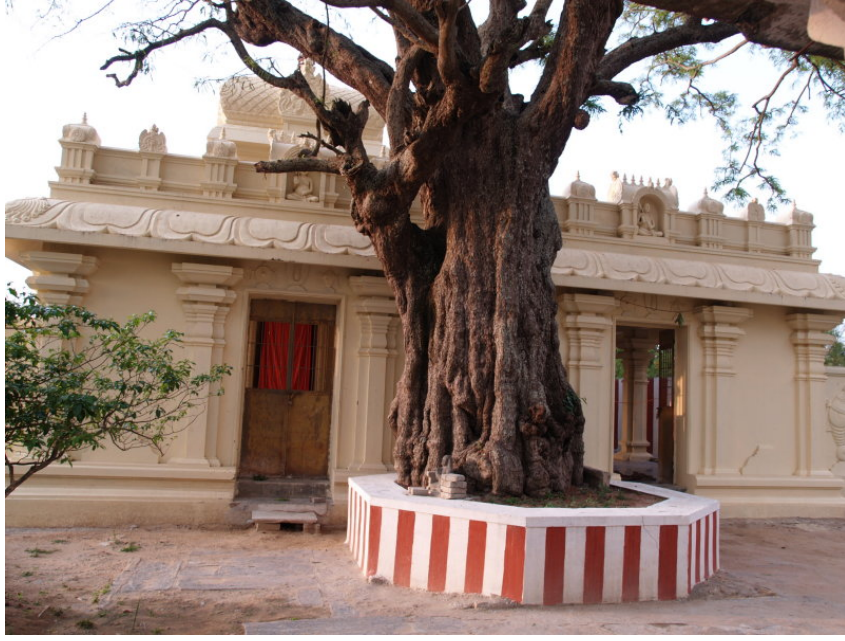
Sri Adhi Van Satakopa Jeer Brindavanam at Melkote