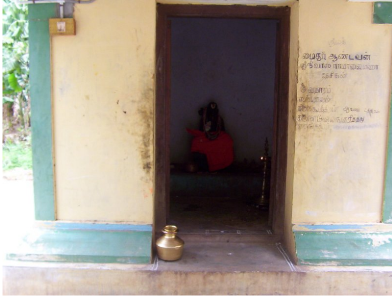
Srimath Mysore Andavan Brindavanam at Sriragam