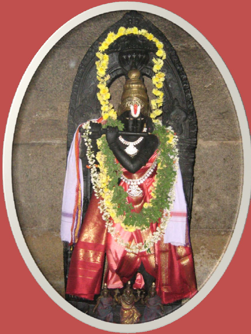
venugopala of hedathale